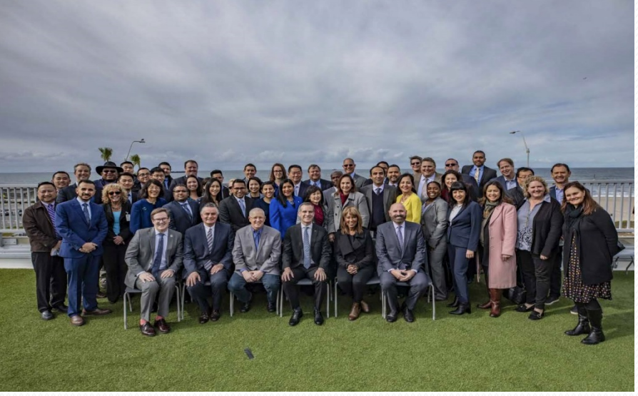
Mayor Garcetti's press conference at Hyperion, February 21, 2019